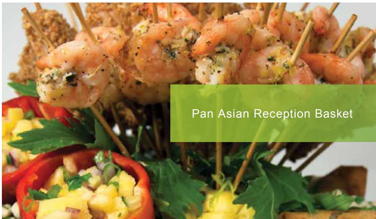
Pan Asian Reception Basket