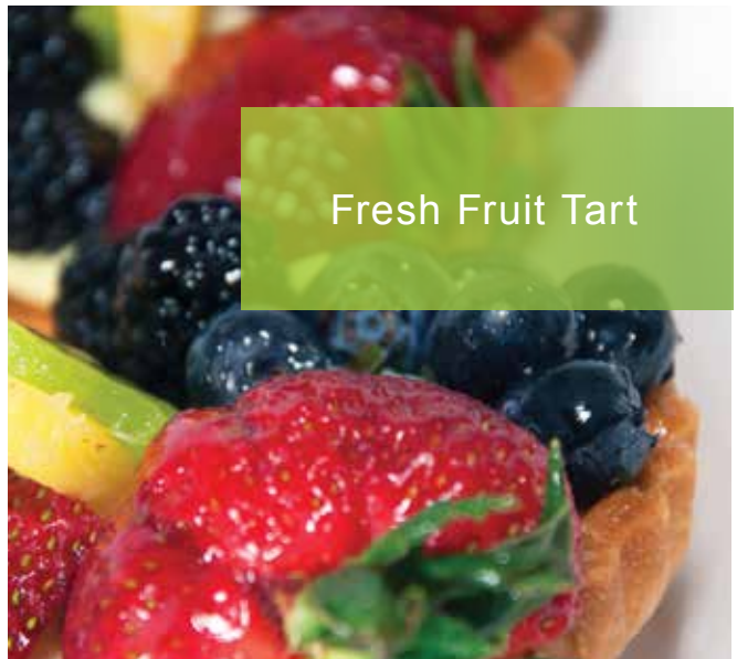
Fresh Fruit Tart